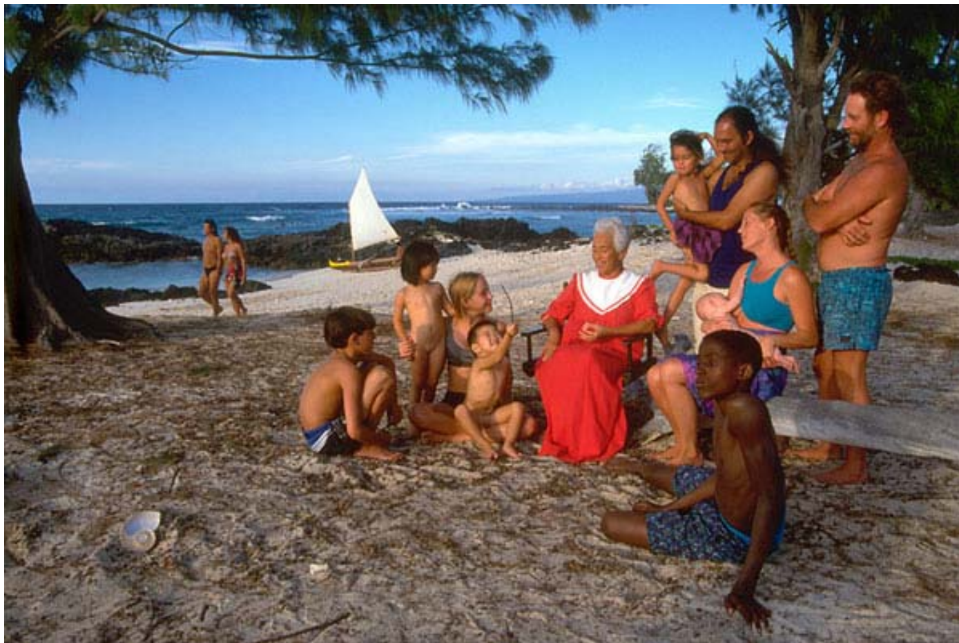
Figure 1. The final Portrait of Humanity, taken in Hawaii.